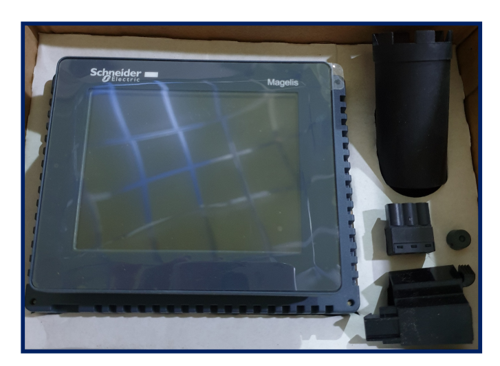
Schneider Electric Magelis HMISTU