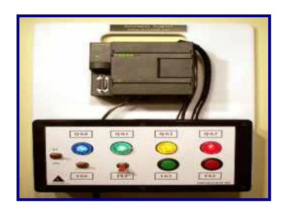
Siemens S7-200 Simulator