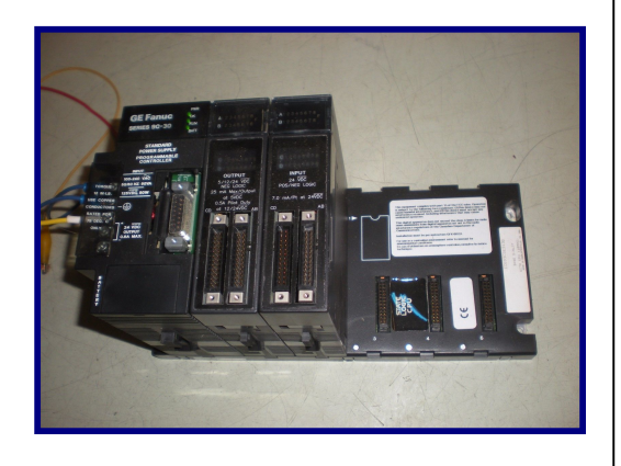
GE Fanuc Series 90-30 PLC Simulator