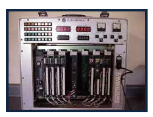
Allen Bradley WS5610 PLC Simulator PLC5