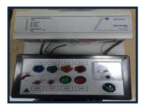
Allen Bradley Micrologix 1000 Simulator (Analog)