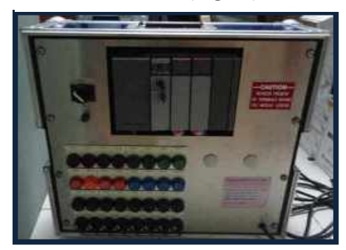
Allen Bradley SLC 5/03