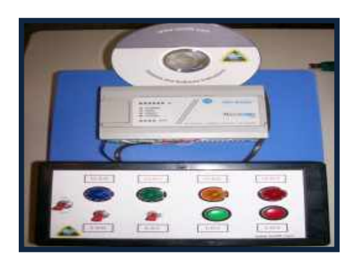
Allen Bradley Micrologix 1000 Simulator (Digital)