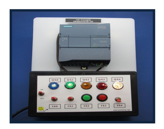
Siemens S7-1200 Simulator