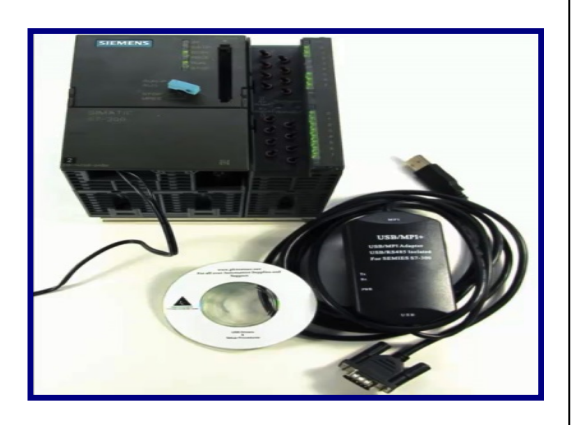
Siemens SIMATIC S7-300