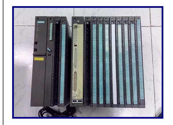
Siemens S7-400 Simulator