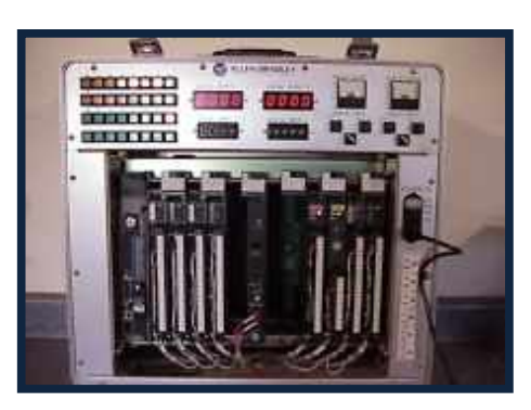
Allen Bradley WS5610 PLC Simulator PLC5