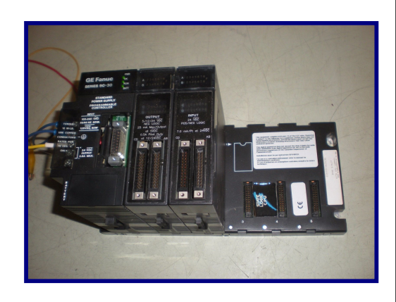
GE Fanuc Series 90-30 PLC Simulator