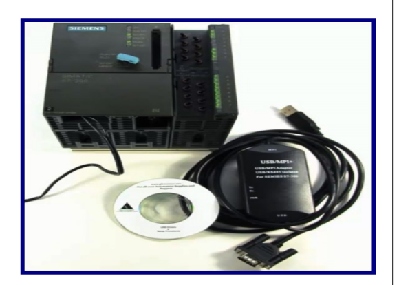
Siemens SIMATIC S7-300