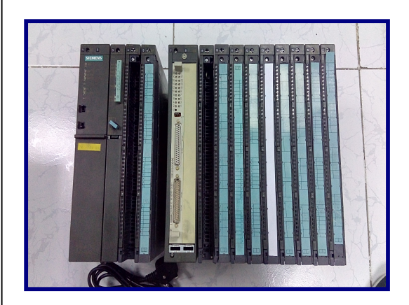
Siemens S7-400 Simulator