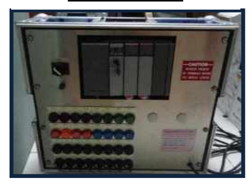
Allen Bradley SLC 5/03