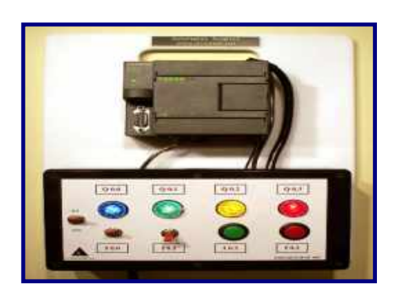
Siemens S7-200 Simulator