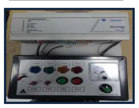
Allen Bradley Micrologix 1000 Simulator (Analog)