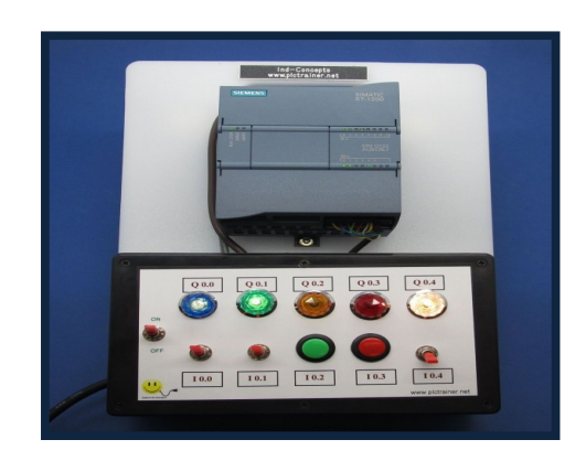
Siemens S7-1200 Simulator