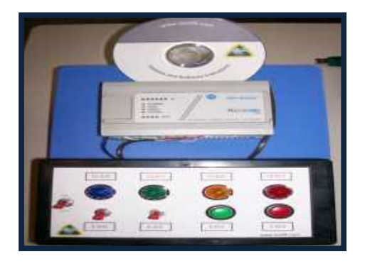
Allen Bradley Micrologix 1000 Simulator (Digital)