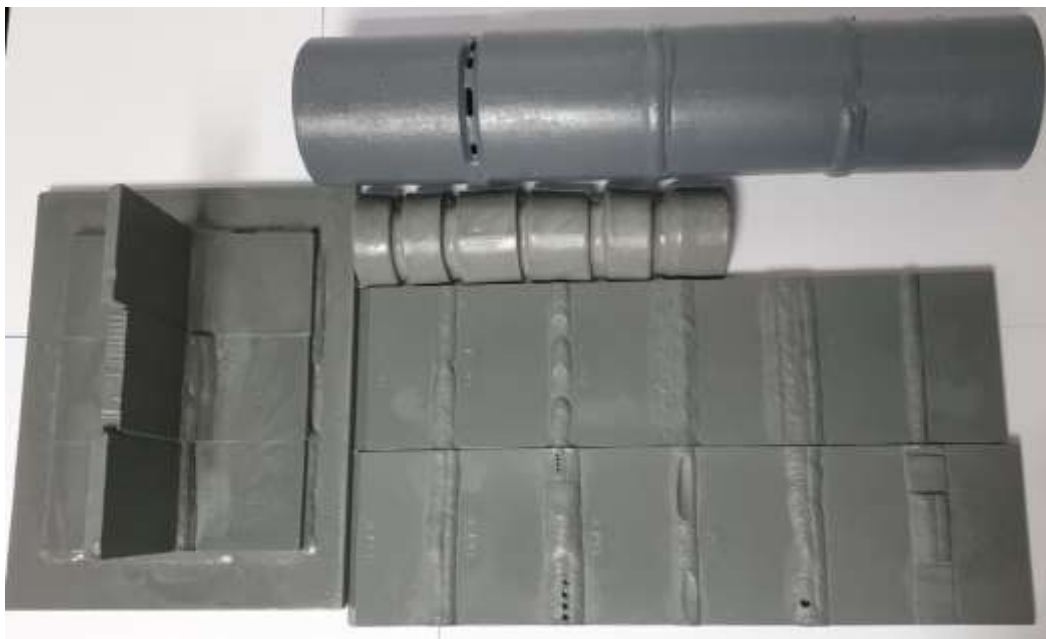
Structural Weld Replica Kit