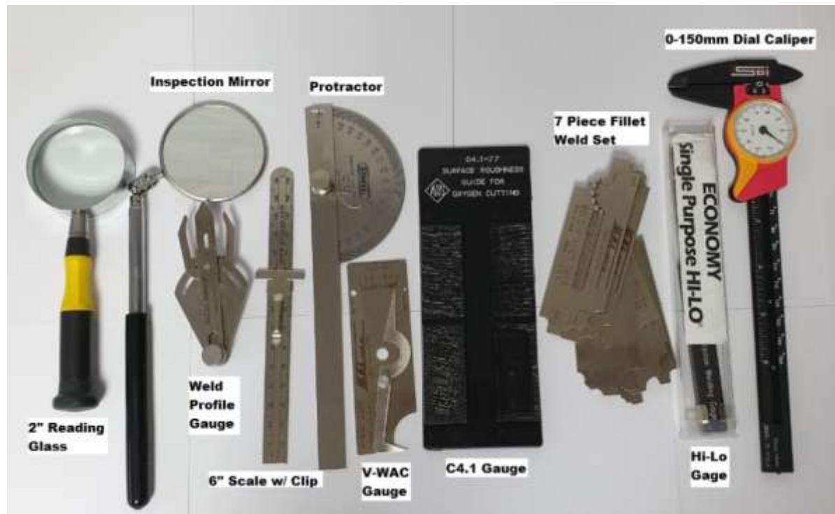
AWS Tool Kit

Practical sessions will be organized during the course for delegates to practice the theory learnt. Delegates will be provided with an opportunity to carryout welding inspection using the “AWS Tool Kit” and “Structural Weld Replica Kit”, suitable for classroom training.