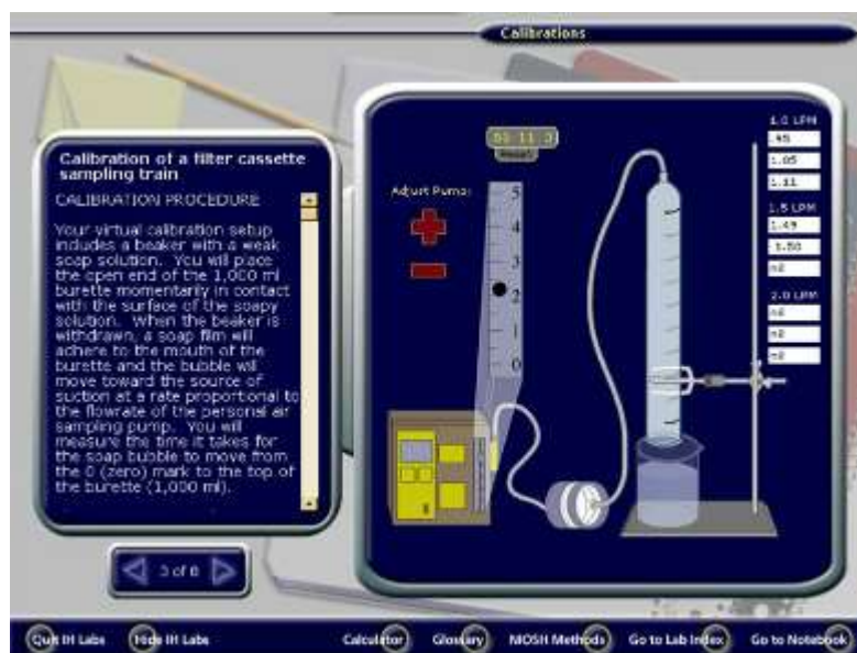
Industrial Hygiene Virtual Laboratory Simulator

Practical sessions will be organized during the course for delegates to practice the theory learnt. Delegates will be provided with an opportunity to carryout various exercises using the state-of-the-art “Industrial Hygiene Virtual Laboratory Simulator”, “CIHprep V9.0 Simulator”, “Extech 445580: Humidity/Temperature Pen” and “Digital Sound Level Meter”.