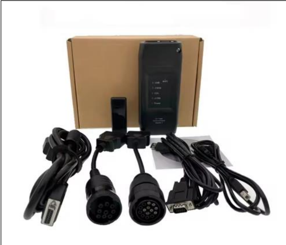
CAT Communication Adapter Diagnostic Tool

Practical sessions will be organized during the course for delegates to practice the theory learnt. Delegates will be provided with an opportunity to carryout various exercises using the “CAT Communication Adapter Diagnostic Tool”.