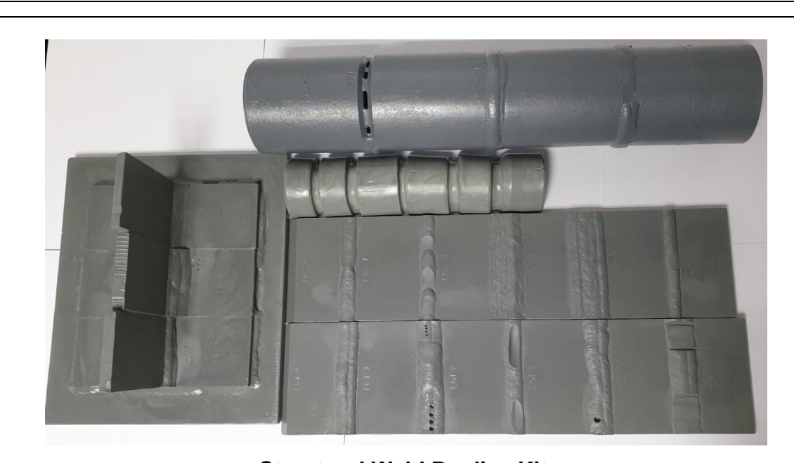
Structural Weld Replica Kit