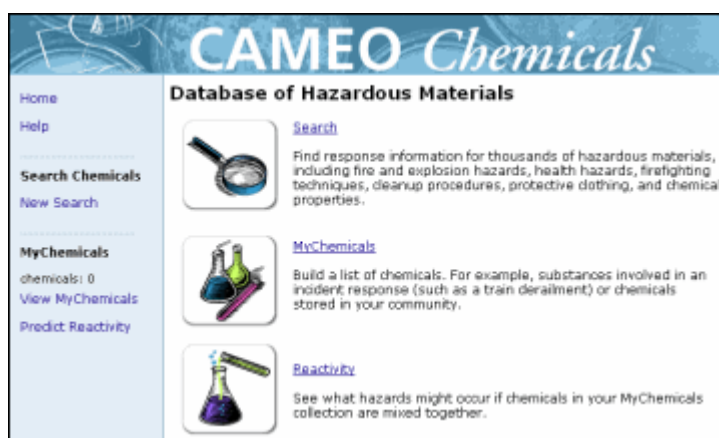
CAMEO Chemicals Suite Software