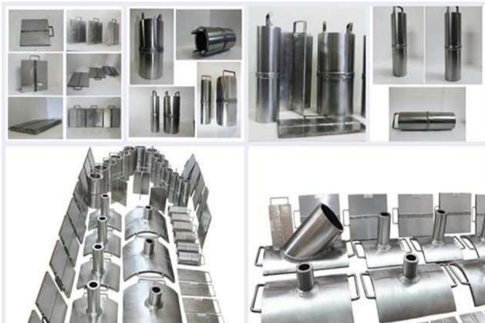
Flawed Specimen Test Components