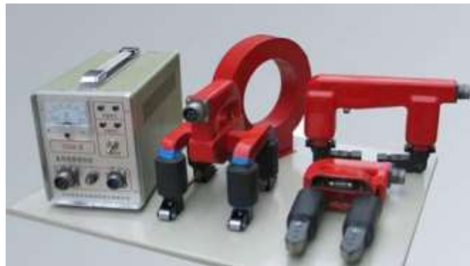
Magnetic Particle Testing (MT) Equipment