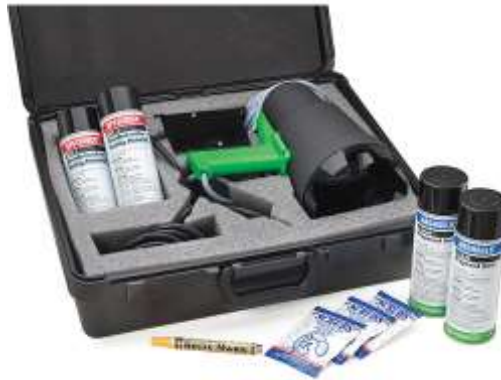
Liquid Penetrant Testing (PT) Equipment