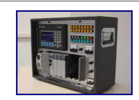
Allen Bradley SLC 500 Simulator

Practical sessions will be organized during the course for delegates to practice the theory learnt. Delegates will be provided with an opportunity to carryout various exercises using one of our state-of-the-art simulators "Allen Bradley SLC 500", "AB Micrologix 1000 (Digital or Analog)", "AB SLC5/03", "AB WS5610 PLC", "Siemens S7-1200", Siemens S7-400" "Siemens SIMATIC S7-300", "Siemens S7-200" "GE Fanuc Series 90-30 PLC", "Siemens SIMATIC Step 7 Professional Software", and "HMI SCADA".