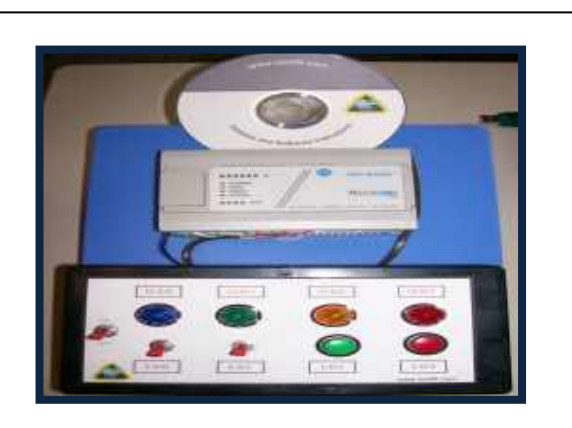
Allen Bradley Micrologix 1000 Simulator (Digital)