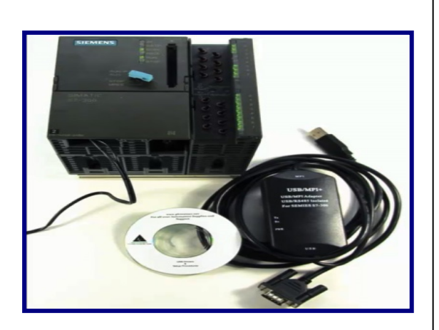
Siemens SIMATIC S7-300