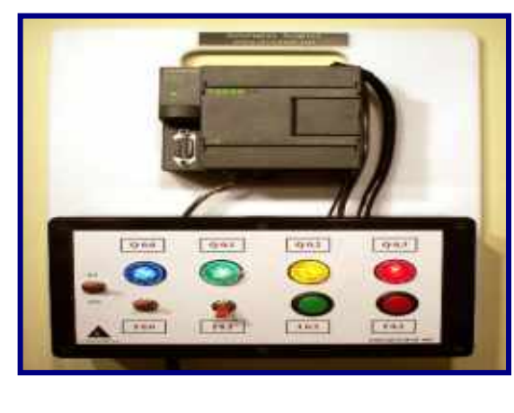
Siemens S7-200 Simulator