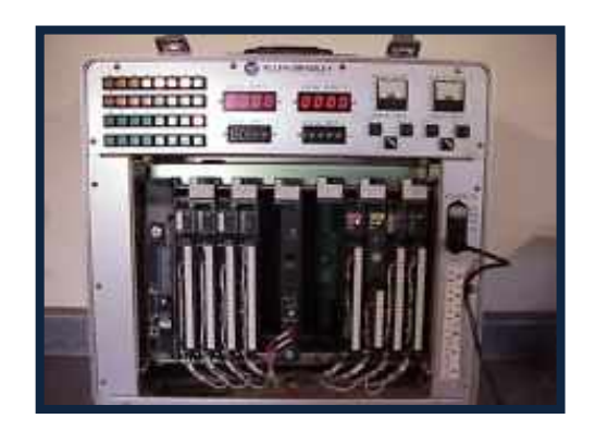
Allen Bradley WS5610 PLC Simulator PLC5