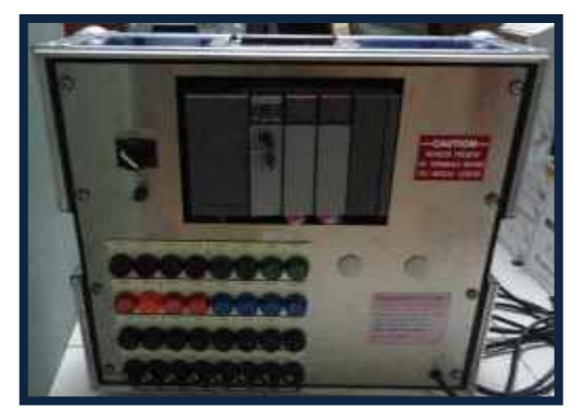
Allen Bradley SLC 5/03