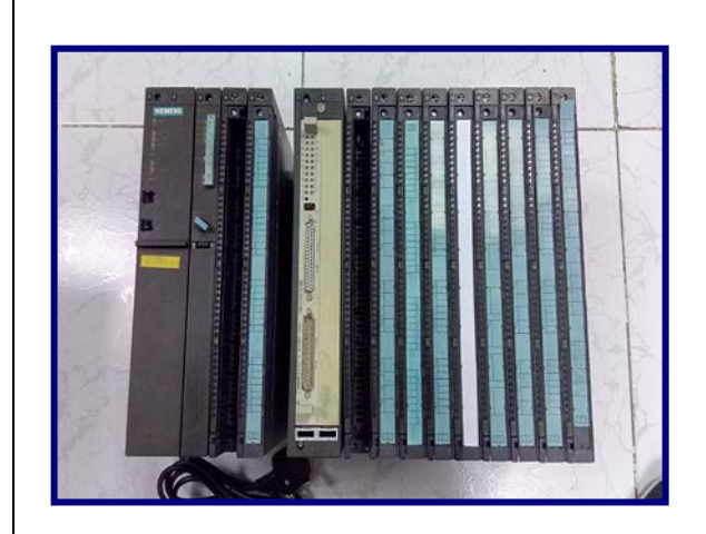
Siemens S7-400 Simulator