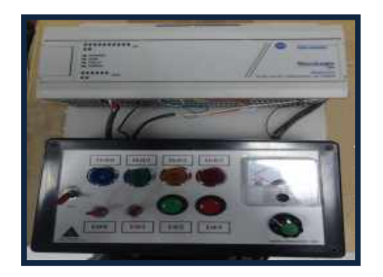
Allen Bradley Micrologix 1000 Simulator (Analog)