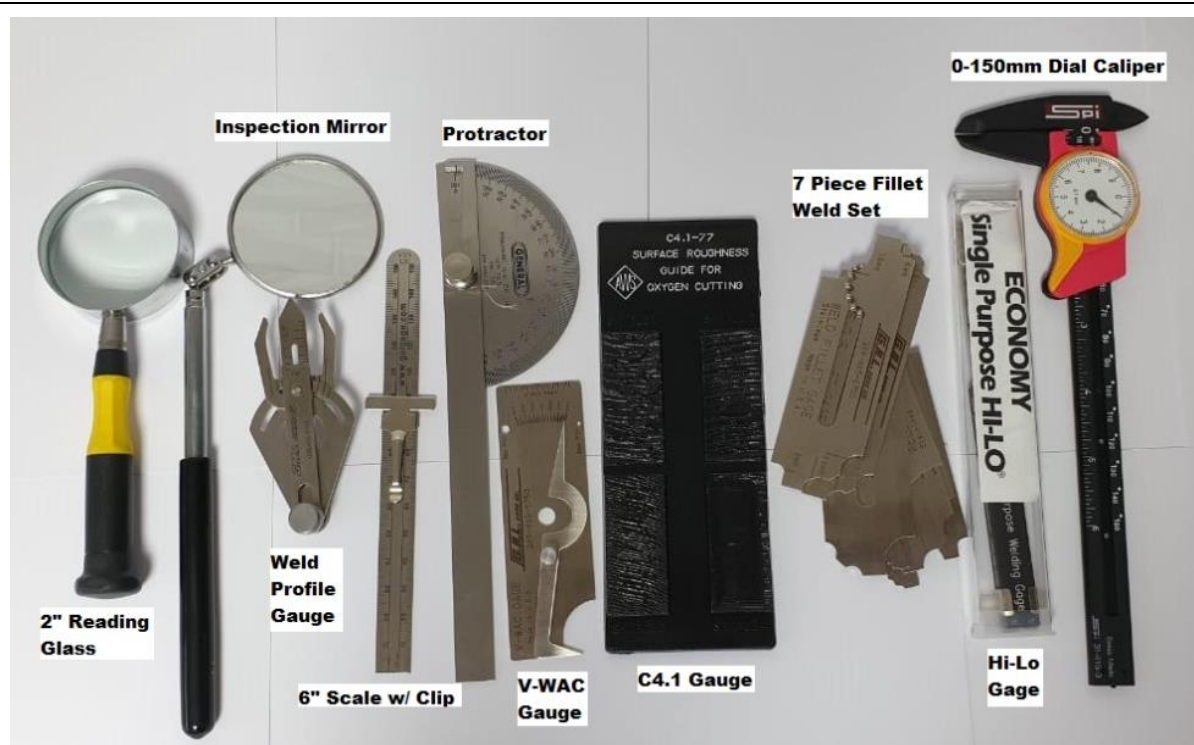
AWS Tool Kit

Practical sessions will be organized during the course for delegates to practice the theory learnt. Delegates will be provided with an opportunity to carryout welding inspection using the “AWS Tool Kit” and “Structural Weld Replica Kit”, suitable for classroom training.