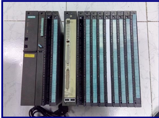
Siemens S7-400 Simulator