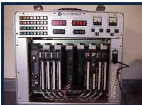
Allen Bradley WS5610 PLC Simulator PLC5