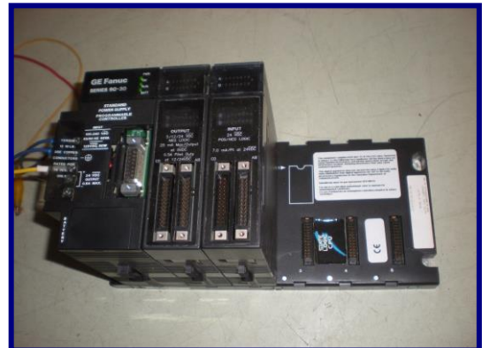
GE Fanuc Series 90-30 PLC Simulator