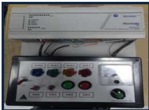
Allen Bradley Micrologix 1000 Simulator (Analog)