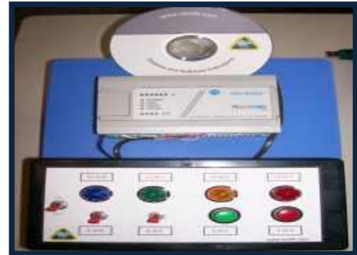
Allen Bradley Micrologix 1000 Simulator (Digital)