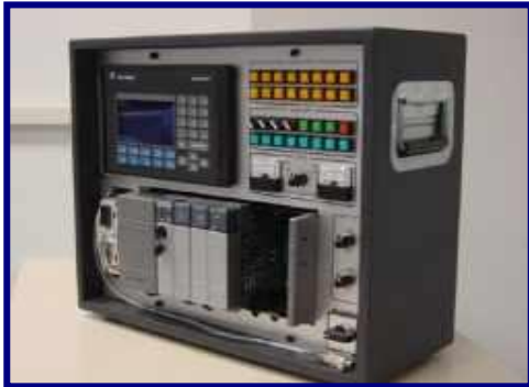
Allen Bradley SLC 500 Simulator

Practical sessions will be organized during the course for delegates to practice the theory learnt. Delegates will be provided with an opportunity to carryout various exercises using one of our state-of-the-art simulators “Allen Bradley SLC 500”, “AB Micrologix 1000 (Digital or Analog)”, “AB SLC5/03”, “AB WS5610 PLC”, “Siemens S7-1200”, Siemens S7-400” “Siemens SIMATIC S7-300”, “Siemens S7-200” “GE Fanuc Series 90-30 PLC”, “Siemens SIMATIC Step 7 Professional Software”, and “CIMPLICITY Software”.