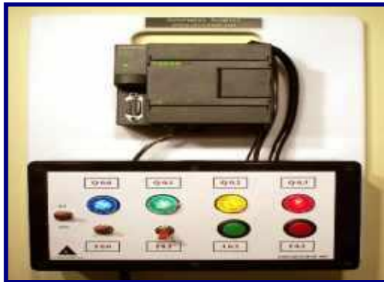
Siemens S7-200 Simulator