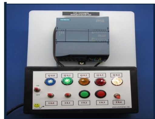
Siemens S7-1200 Simulator