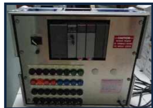
Allen Bradley SLC 5/03