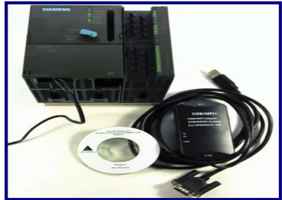
Siemens SIMATIC S7-300