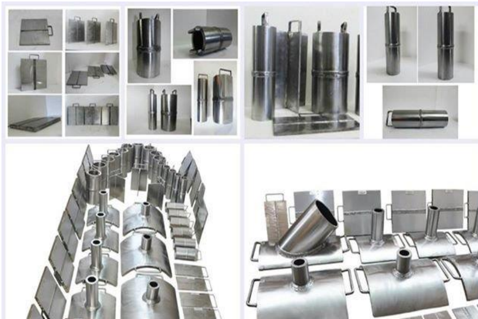
Flawed Specimen Test Components