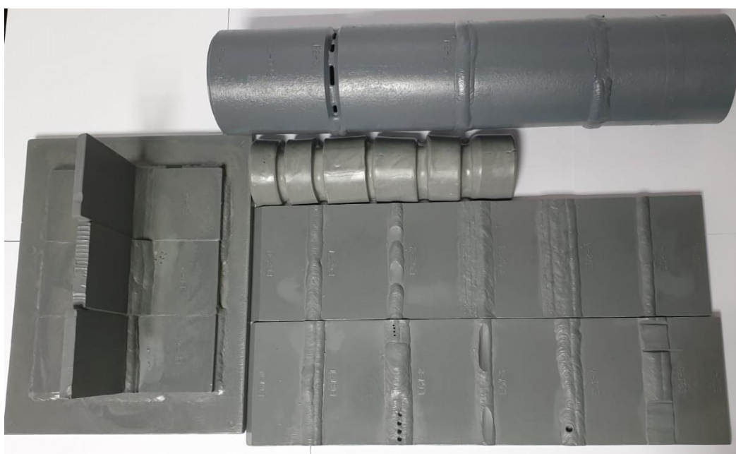
Structural Weld Replica Kit