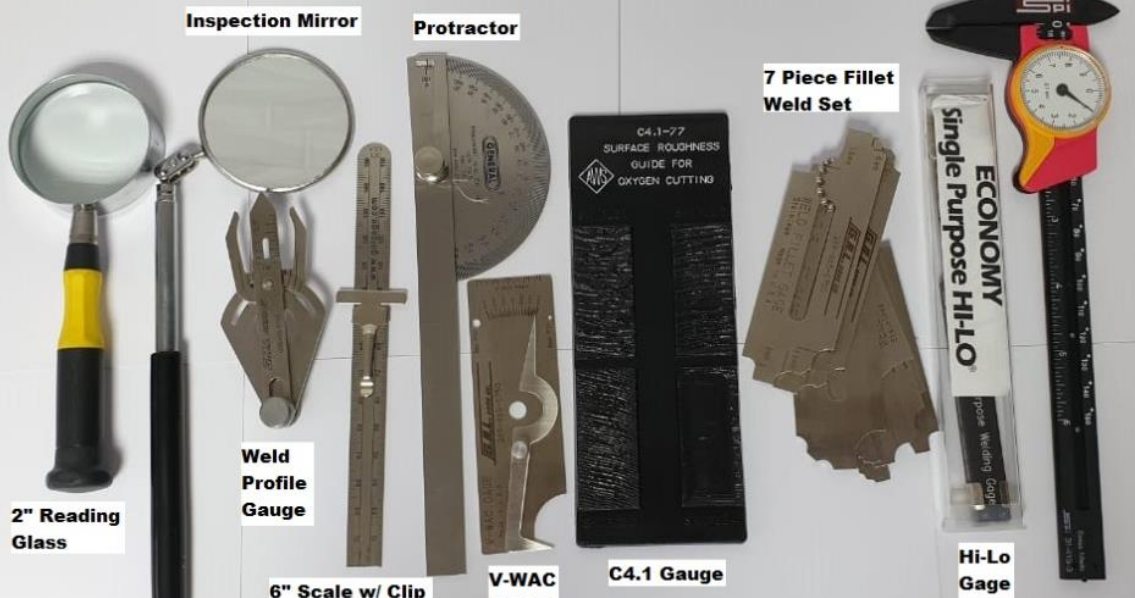
AWS Tool Kit