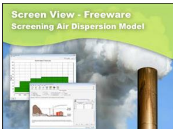
US EPA SCREEN3 Model