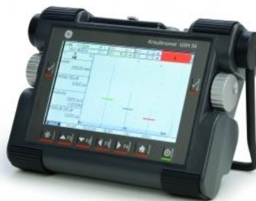
Ultrasonic Testing Package USM 36