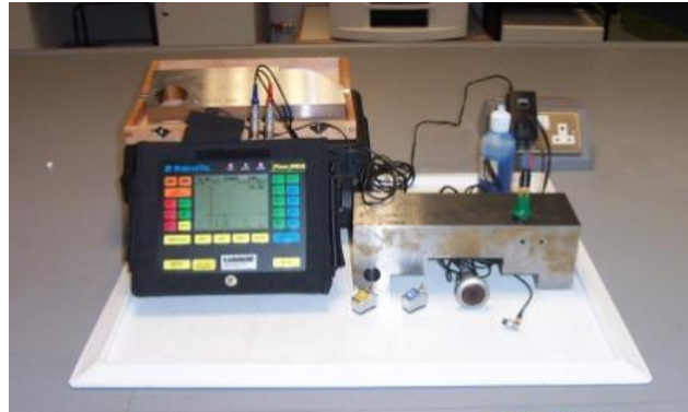
Ultrasonic Testing (UT) Equipment

Practical sessions will be organized during the course for delegates to practice the theory learnt. Delegates will carryout NDT inspection using our “Acoustic Emission Testing (AE) Equipment” and our specifically designed flawed specimen test components.