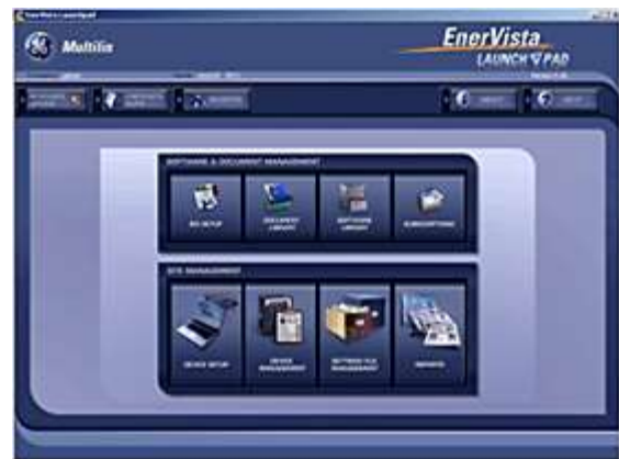
GE Multilin Relay 750 Simulator