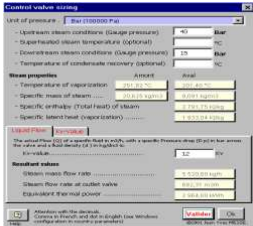
Valve Sizing Simulator