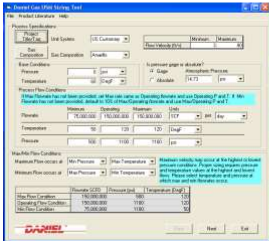
Gas Ultrasonic Meter (USM) Sizing Tool Simulator