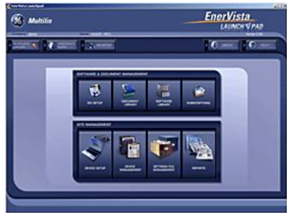
GE Multilin Relay 469 Simulator