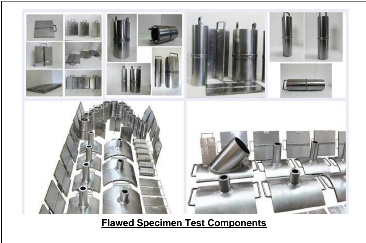
Flawed Specimen Test Components