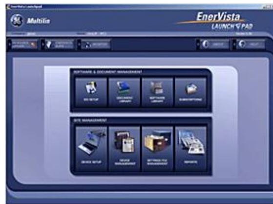
GE Multilin Relay 750 Simulator