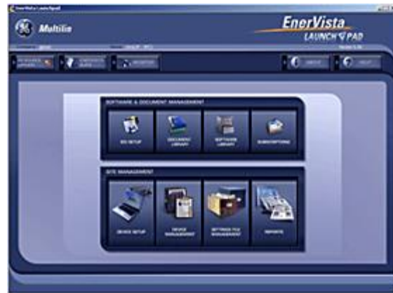
GE Multilin Relay 469 Simulator