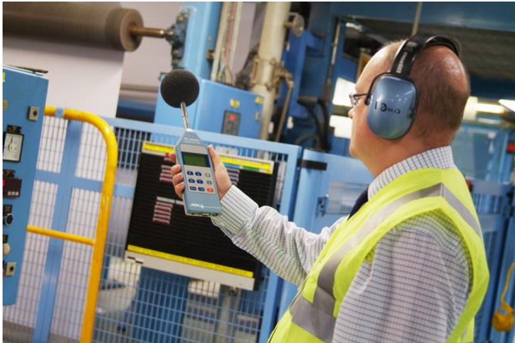
Sound Level Meter

Practical sessions will be organized during the course for delegates to practice the theory learnt. Delegates will be provided with an opportunity to carryout various exercises using our state-of-the-art “Sound Level Meter”, “Industrial Hygiene Virtual Laboratory” and “CIHprep V9.0 ” simulators.