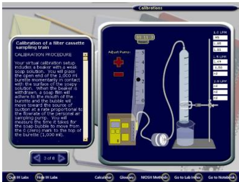
Industrial Hygiene Virtual Laboratory Simulator