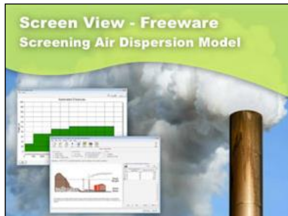
US EPA SCREEN3 Model