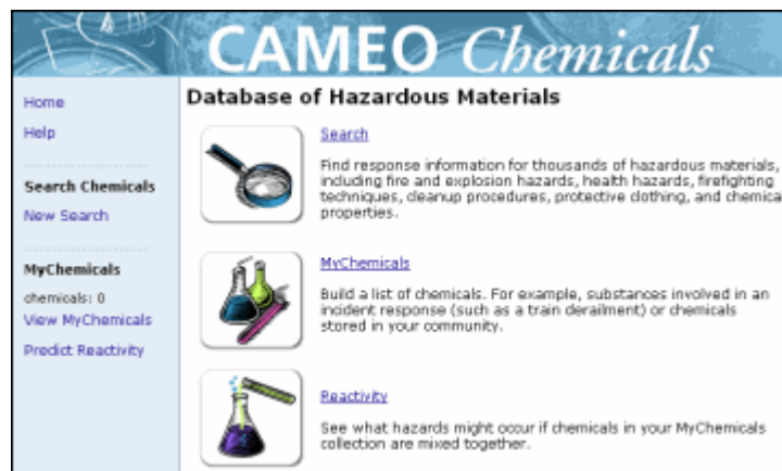
CAMEO Chemicals Suite Software