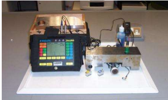
Ultrasonic Testing (UT) Equipment