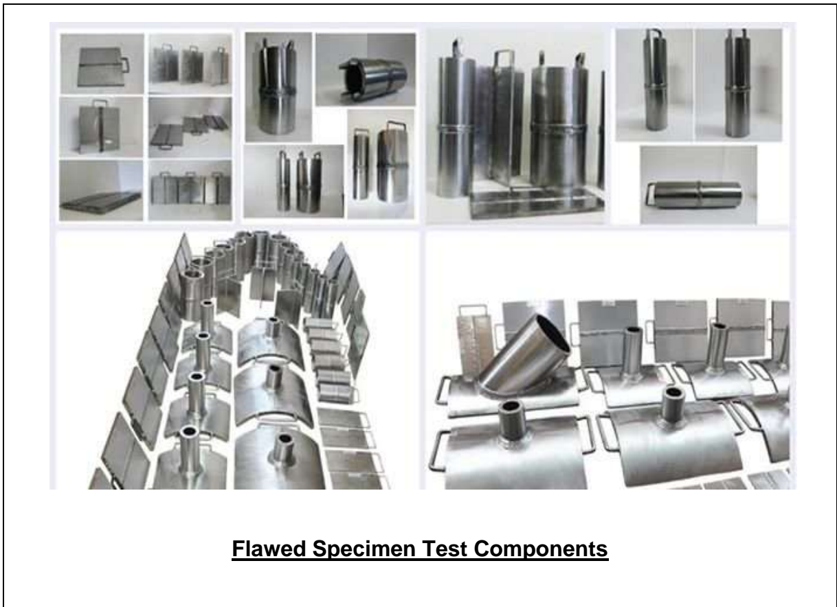
Flawed Specimen Test Components