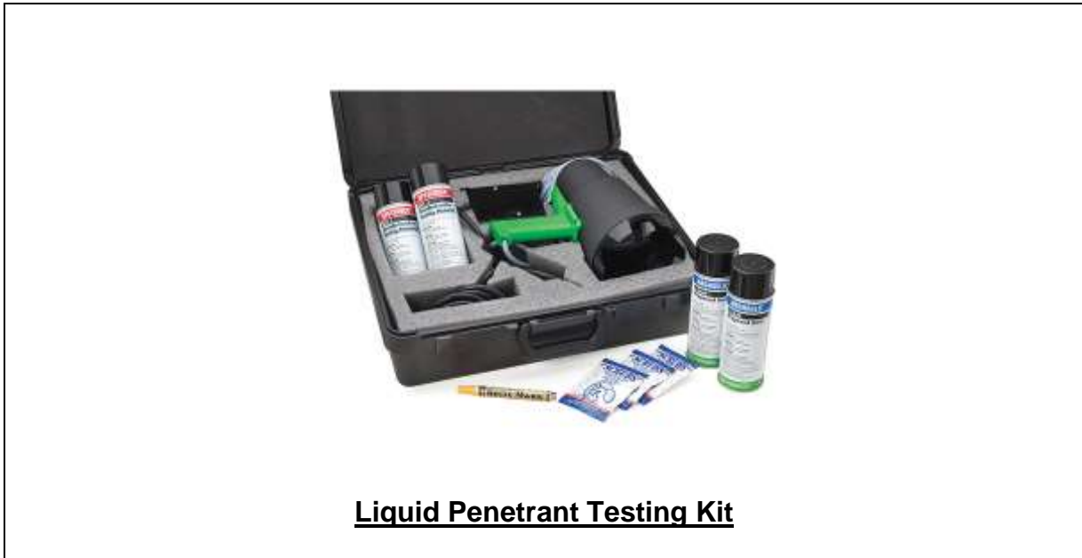
Liquid Penetrant Testing Kit