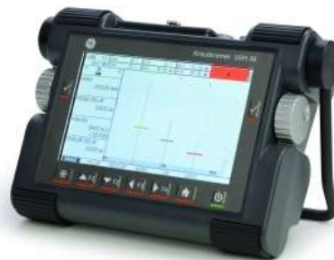
Ultrasonic Testing Package USM 36