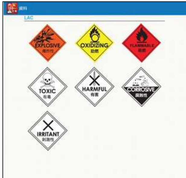
Chemical Safety Database Simulator