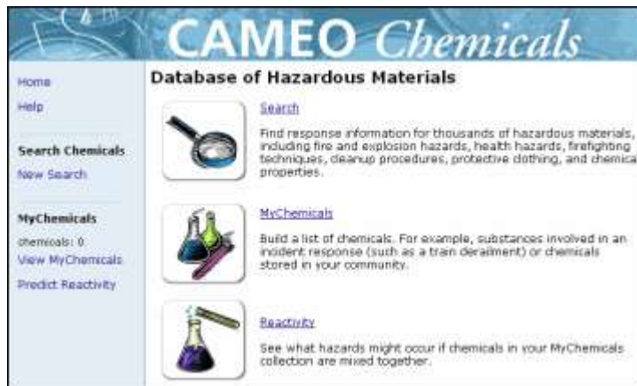
CAMEO Chemicals Suite Simulator