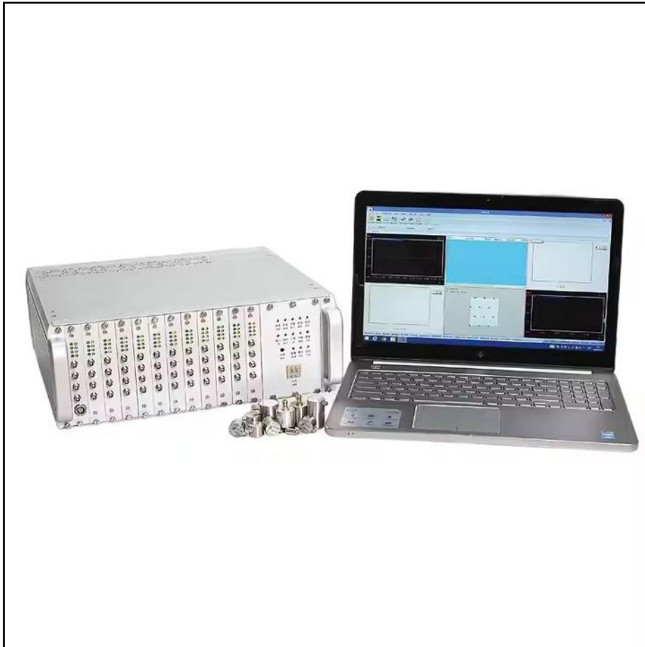
Acoustic Emission Testing (AE) Equipment

Practical sessions will be organized during the course for delegates to practice the theory learnt. Delegates will carry out NDT inspection using our “Acoustic Emission Testing (AE) Equipment” and our specifically designed flawed specimen test components.