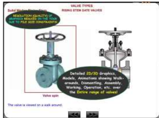
Valve Simulator 3.0