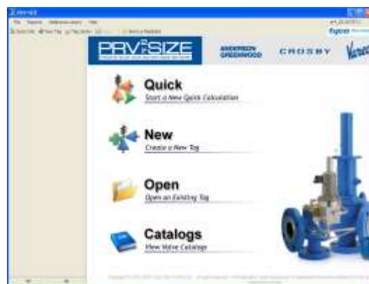
PRV 2 SIZE Simulator