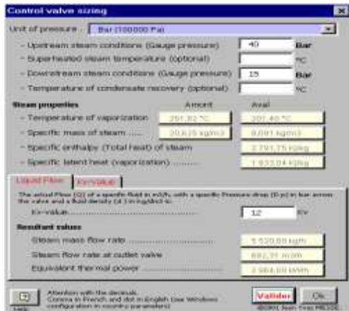
Valve Sizing Simulator

Practical sessions will be organized during the course for delegates to practice the theory learnt. Delegates will be provided with an opportunity to carryout various exercises using our state-of-the-art simulators “Valve Sizing Simulator”, “Valve Simulator 3.0”, “Valvestar 7.2 Simulator” and “PRV 2 SIZE Simulator”.