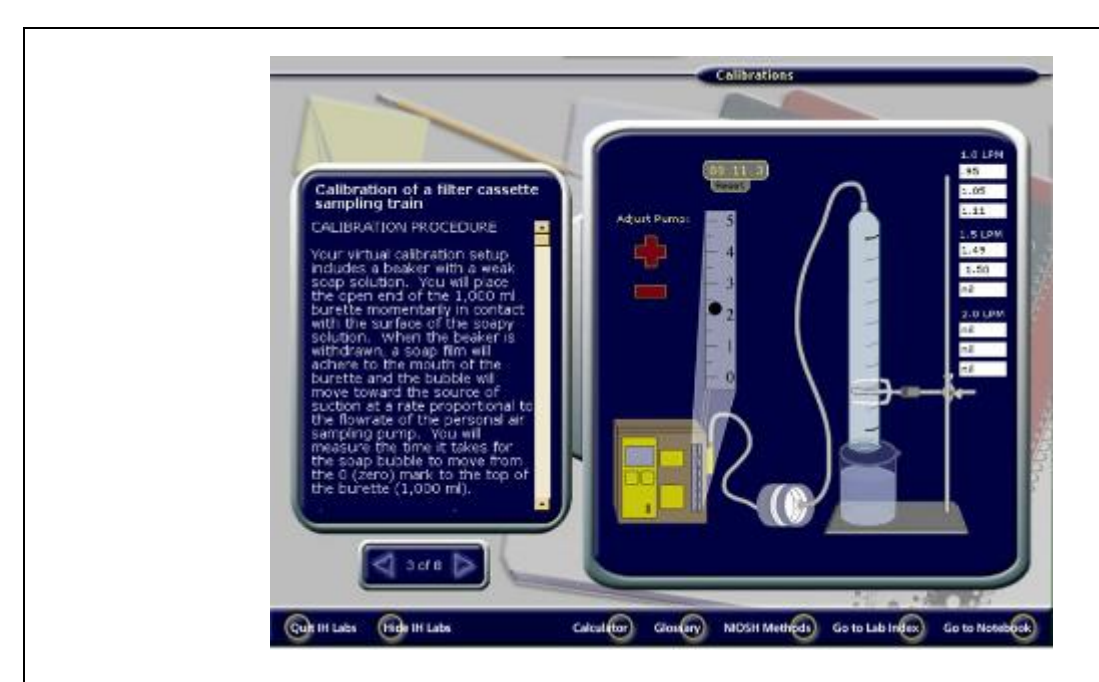
Industrial Hygiene Virtual Laboratory Simulator

Practical sessions will be organized during the course for delegates to practice the theory learnt. Delegates will be provided with an opportunity to carryout various exercises using the state-of-the-art "Industrial Hygiene Virtual Laboratory Simulator", "CIHprep V9.0 Simulator", "Extech 445580: Humidity/Temperature Pen" and "Digital Sound Level Meter".