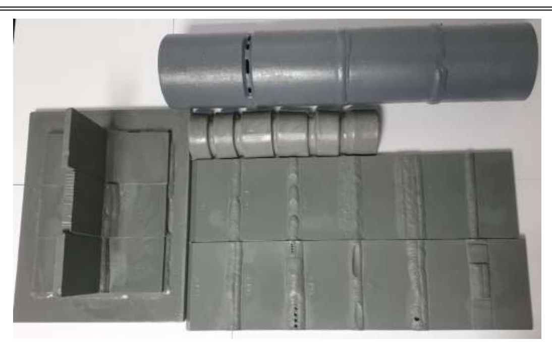
Structural Weld Replica Kit