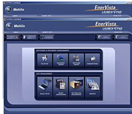
GE Multilin Relay 750 Simulator