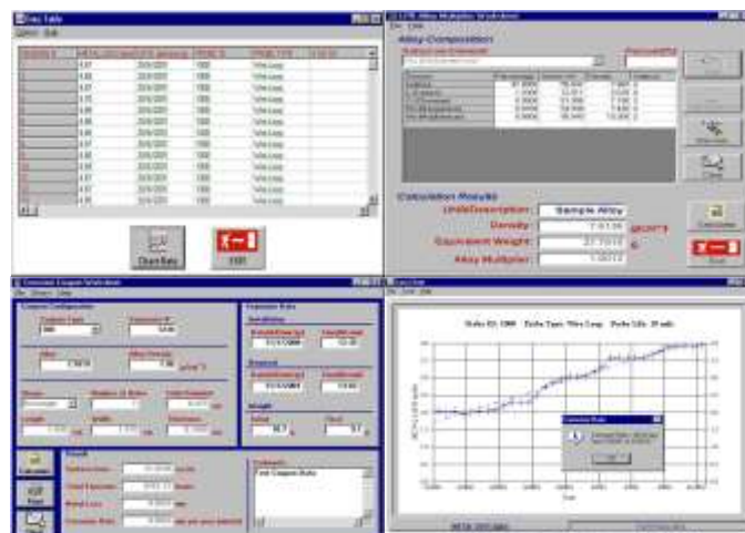
Corrosion Data Management Software (CDMS)

Practical sessions will be organized during the course for delegates to practice the theory learnt. Delegates will be provided with an opportunity to carryout various exercises using the simulators “Corrosion Data Management Software (CDMS)” and “Electronic Corrosion Engineer (ECE®) 5”.