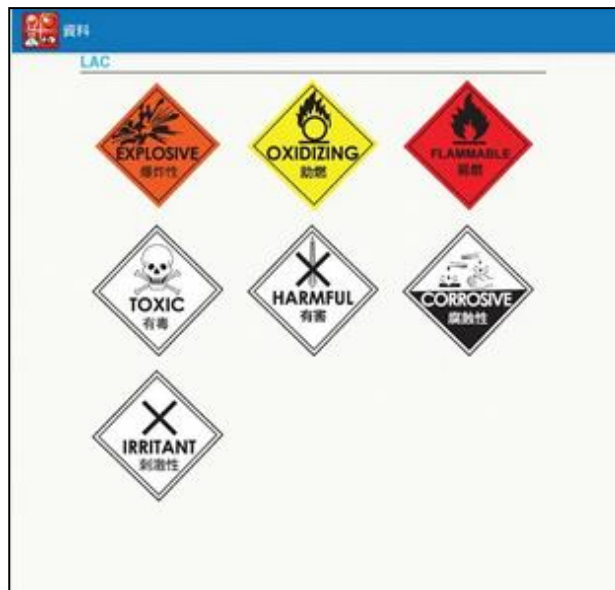
Chemical Safety Database Simulator