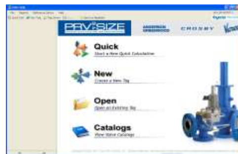
PRV 2 SIZE Software