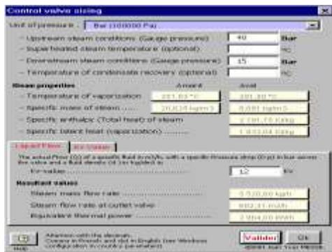
Valve Sizing Software

Practical sessions will be organized during the course for delegates to practice the theory learnt. Delegates will be provided with an opportunity to carryout various exercises using our state-of-the-art simulators “Valve Sizing Software”, “Valve Software 3.0”, “Valvestar 7.2 Software” and “PRV 2 SIZE Software”.