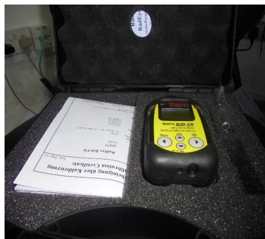
Thermo Scientific RadEye B20-ER Model