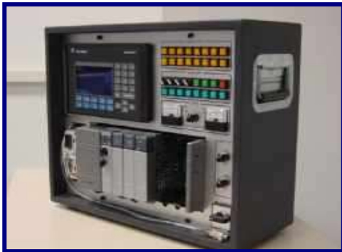
Allen Bradley SLC 500 Simulator

Practical sessions will be organized during the course for delegates to practice the theory learnt. Delegates will be provided with an opportunity to carryout various exercises using one of our state-of-the-art simulators “Allen Bradley SLC 500”, “AB Micrologix 1000 (Digital or Analog)”, “AB SLC5/03”, “AB WS5610 PLC”, “Siemens S7-1200”, Siemens S7-400” “Siemens SIMATIC S7-300”, “Siemens S7-200” “GE Fanuc Series 90-30 PLC”, “Siemens SIMATIC Step 7 Professional Software”, and “CIMPLICITY Software”.