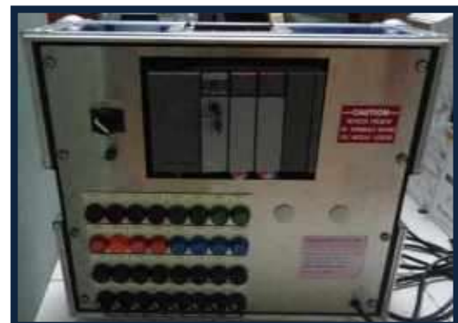
Allen Bradley SLC 5/03