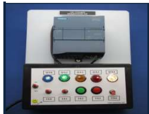
Siemens S7-1200 Simulator