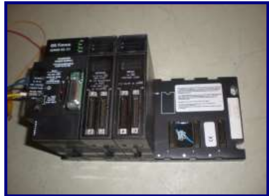
GE Fanuc Series 90-30 PLC Simulator