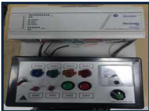
Allen Bradley Micrologix 1000 Simulator (Analog)