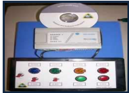
Allen Bradley Micrologix 1000 Simulator (Digital)