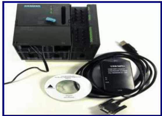
Siemens SIMATIC S7-300