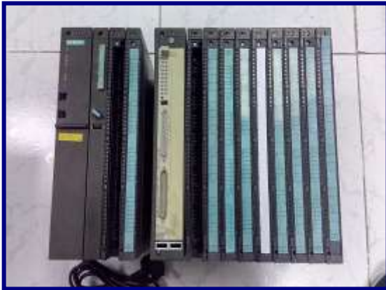
Siemens S7-400 Simulator