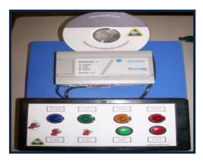
Allen Bradley Micrologix 1000 Simulator (Digital)

Practical sessions will be organized during the course for delegates to practice the theory learnt. Delegates will be provided with an opportunity to carryout various exercises using one of our state-of-the-art simulators "AB Micrologix 1000 (Digital)" and "Logix Pro 500".