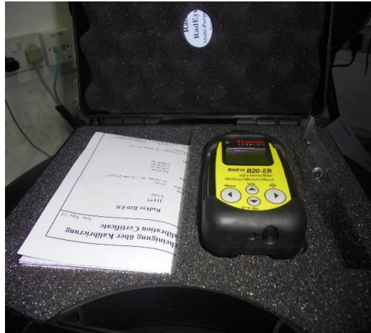
Thermo Scientific RadEye B20-ER Model